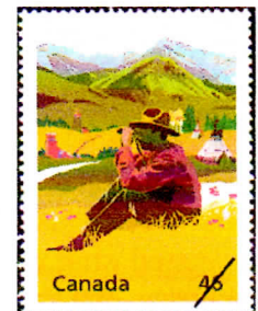
Also designed by Tim Nokes.

National and Provincial Parks and Historical sites would be a good topic for thematic stamp collectors. A lot of the large National Parks have been featured on high value