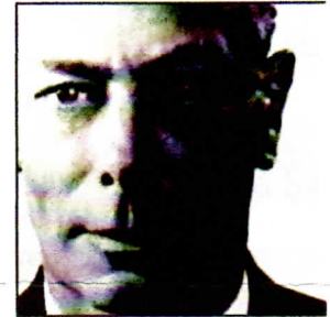
A close up of the Wilding portrait. Note how the heavy shadow accentuates the ear.

In a strange irony that was typical of his reign things just did not seem to go in the King's favour. From the 'Cabinet Conclusions', dated May 27, 1949 Prime Minister St. Laurent mentioned that the proposal for a new issue of postage stamps to be printed in only one language had aroused criticism in some quarters and enquired what were the considerations that prompted this change in policy. The Post Master General, Mr. Bertrand, explained that, by international agreement, excess wording was being eliminated ( The King's Ear is continued on the next page )